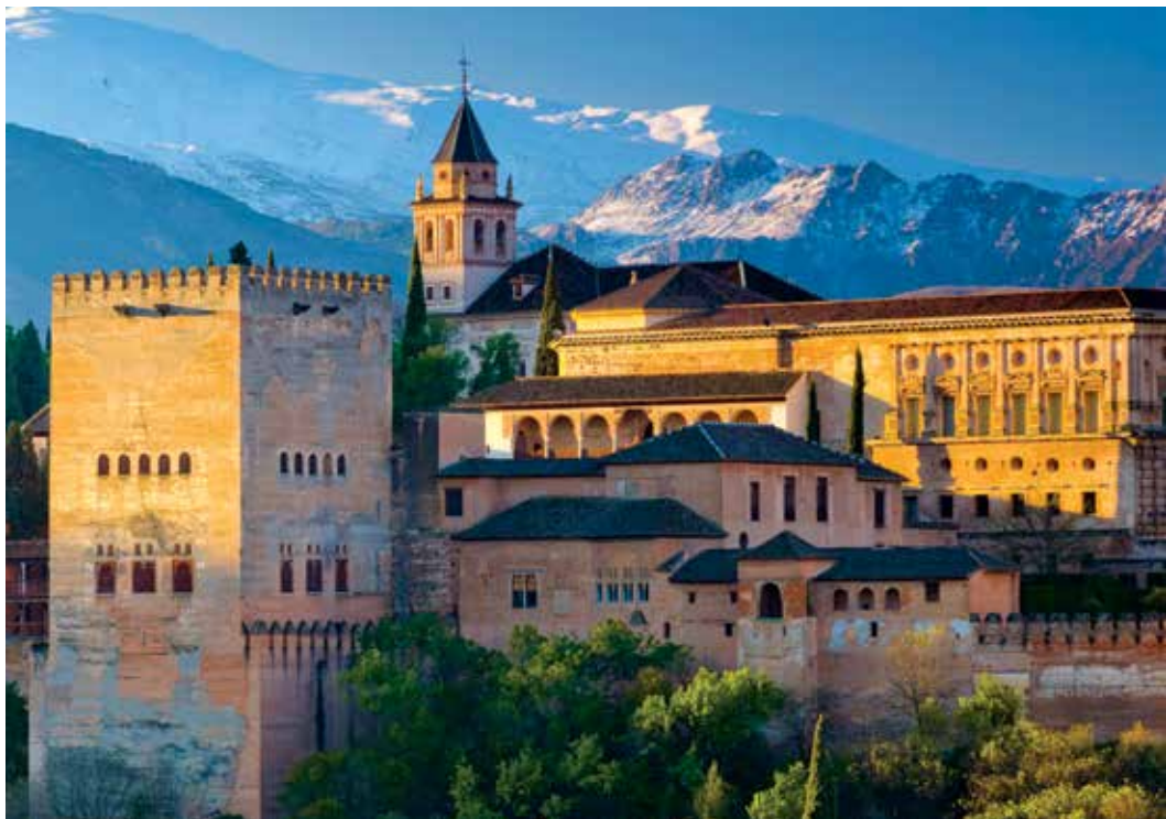
We see Granada's Alhambra, the Moor's "pearl set in emeralds," on Day 11.

region and city of beauty and romance. This is the place that inspired Carmen and Don Giovanni ; where fragrant orange trees and flower-bedecked balconies delight the senses; and home of the renowned Catédral , the world's largest Gothic building. After a tour that includes the Alcázar palace and the Arab quarter, the afternoon is free to explore independently. We return to Carmona late afternoon and dine at our parador this evening. B,D