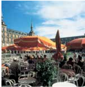
Plaza Mayor in Madrid

Day 12: Úbeda/Toledo/Madrid A highlight is in store today as we visit Toledo, capital of medieval Spain. Declared a Spanish National Landmark, the city is little changed visually from its 16 th -century days as a subject for the artist El Greco. Toledo boasts an incomparable hilltop setting overlooking the Castilian plains and surrounded on three sides by the Tagus River. After lunch on our own we see Toledo’s most important sights on our guided tour, including the massive Gothic Cathedral begun in 1226 and not finished until 1493. Then we continue on to Madrid, arriving late afternoon. Dinner tonight is on our own; perhaps to dine late as the Madridileños do. B