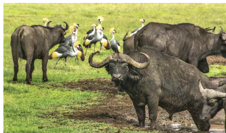
Serengeti National Park