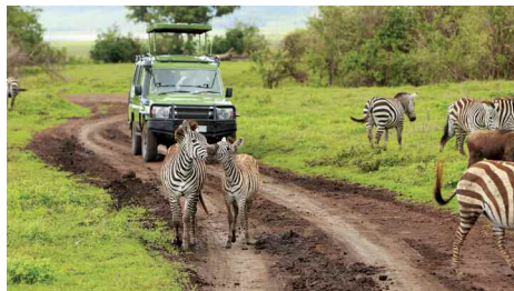
Ngorongoro Conservation Area

These two also form the Serengeti-Ngorongoro Biosphere Reserve.